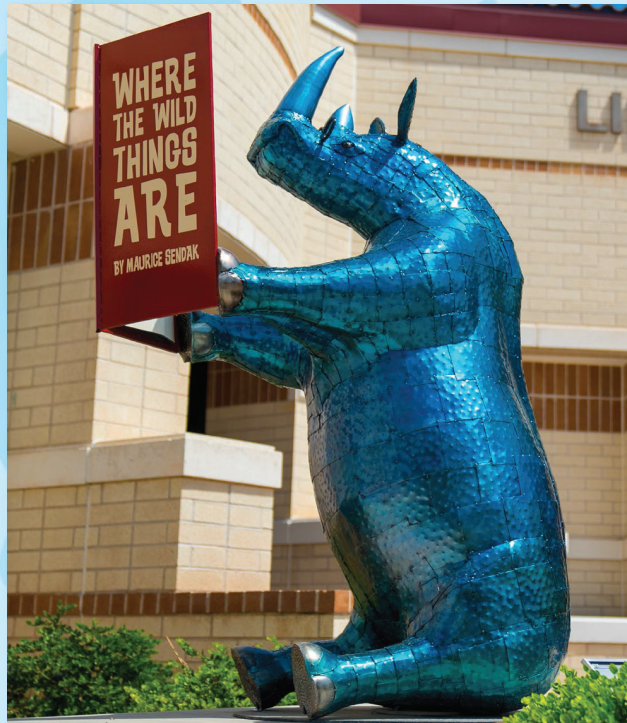
Doug Boyd IN FLUX Temporary Art Program