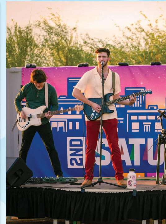
Alibi 2 nd Saturdays