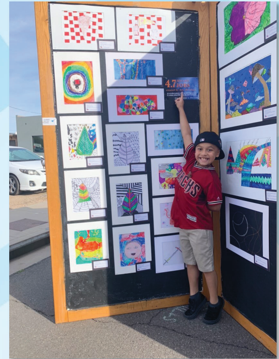
Arts & Cultural Festival