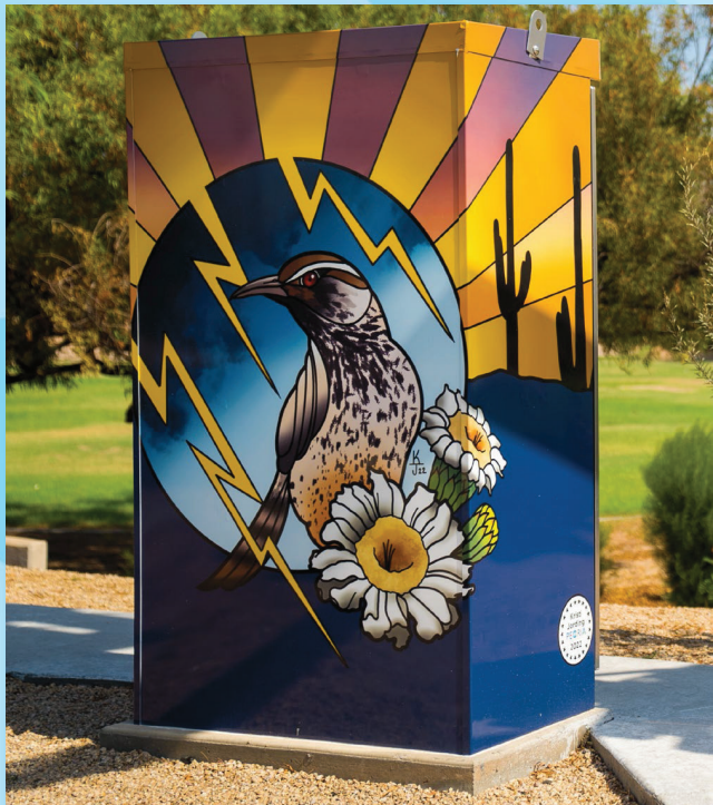
Kristi Lording Utility Box Art Wrap Program