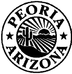
EXHIBIT A LEGAL DESCRIPTION

THE LAND REFERRED TO HEREIN BELOW IS SITUATED IN THE SOUTHEAST QUARTER OF SECTION 1, TOWNSHIP 4 NORTH, RANGE 1 EAST, OF THE GILA AND SALT RIVER BASE AND MERIDIAN, MARICOPA COUNTY, ARIZONA, BEING MORE PARTICULARLY DESCRIBED AS FOLLOWS: