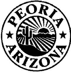
EXHIBIT A SKETCH