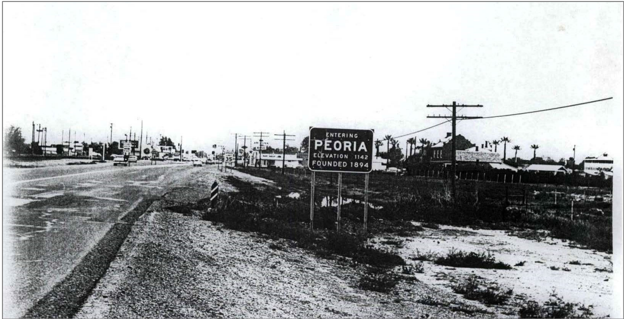
Early Entry into Peoria