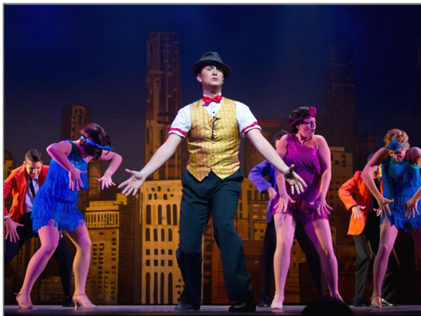
Arizona Broadway Theatre

From the time construction began in 2004 to today, Arizona Broadway Theatre (ABT) has taken great care to create a beautiful, versatile performance space that allows for every type of theatrical production, special event, and musical extravaganza. ABT's main stage performance space includes a 6,300 square-foot house with table seating for 470 patrons, where every seat in the house has an unobstructed view of the stage. ABT's balcony section is also available for large party or private group rental, accommodating up to 40 patrons. There is tableside dining with a full menu that changes for each show, and themed towards the production itself.