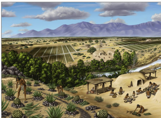
Hohokam Village Rendering

Peoria’s cultural heritage is very diverse, ranging from Native American sites estimated to be over 1,000 years old to post-World War II-era buildings. It is important to understand the history of Peoria in order to establish the historic context and stories of the area, as they continue to provide guidance for identifying the places and things that are important to Peoria’s culture and heritage.