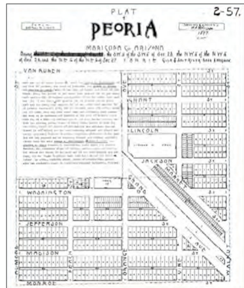
Original Town Plat