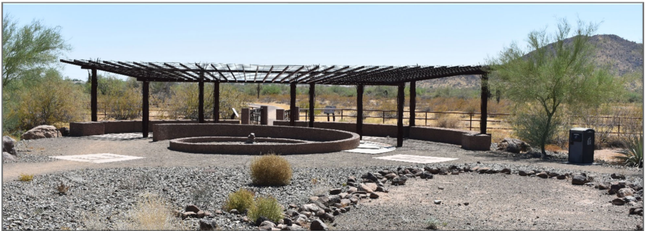
Palo Verde Ruin

One of the major themes of this General Plan is “protecting natural resources and community character.” Historic preservation is one means to achieve this goal. The preservation of Peoria’s historic resources, which includes archaeological sites, enriches the lives of Peoria residents by creating connections to the past. That is because no community can hope to understand its present, or even try to forecast its future if it fails to recognize its past. Only through tracing and preserving its culture and heritage, Peoria can gain a clear sense of the process by which it achieved its present form, values and substance.