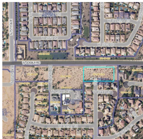
Exhibit 6 - Citizen Participation Plan