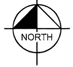
EXHIBIT A APN 142-13-030 RIGHT OF WAY EXHIBIT