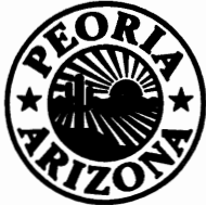
EXHIBIT A LEGAL DESCRIPTION

A PORTION OF THAT EASEMENT FOR PUBLIC WATER LINE RECORDED IN DOCUMENT NO. 2021-0612818, RECORDS OF MARICOPA COUNTY, ARIZONA, LOCATED IN THE SOUTHEAST QUARTER OF THE NORTHWEST QUARTER OF SECTION 36, TOWNSHIP 3 NORTH, RANGE 1 EAST OF THE GILA AND SALT RIVER BASE AND MERIDIAN, MARICOPA COUNTY, ARIZONA, BEING MORE PARTICULARLY DESCRIBED AS FOLLOWS: