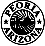
EXHIBIT B EASEMENT DEPICTION