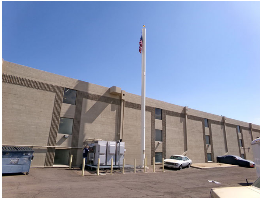
Current site at 8181 W Peoria Ave

PROJECT: Crown Castle proposes a new 71' tall monopalm as a replacement WCF for the existing 50' tall flagpole. The new monopalm would be set adjacent to the existing carrier equipment compound.